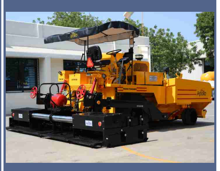
Hydraulically Extendable Screed