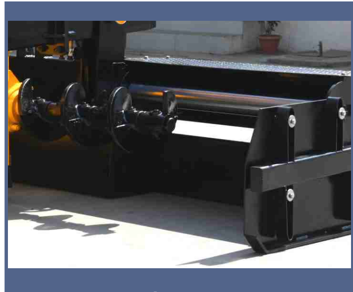
Large Diameter Auger

All in all, its a compact machine with great features.