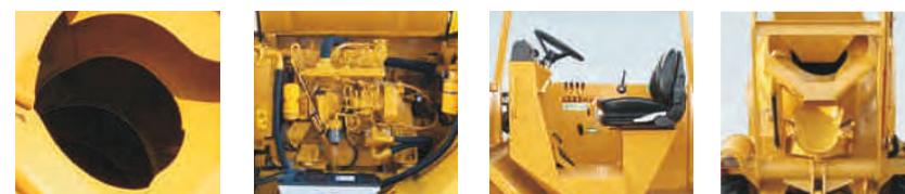
Apollo Carmix Equipments Private Limited