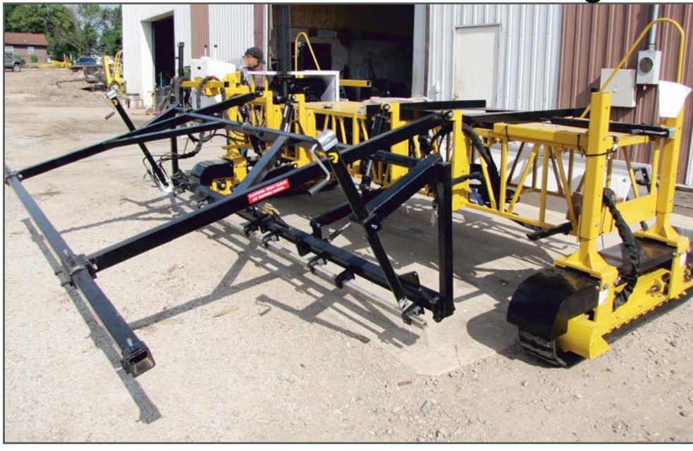
Optional Equipment (not included in base machine)

Custom Solution to Your Paving Needs with Concrete Texture Curing Machine