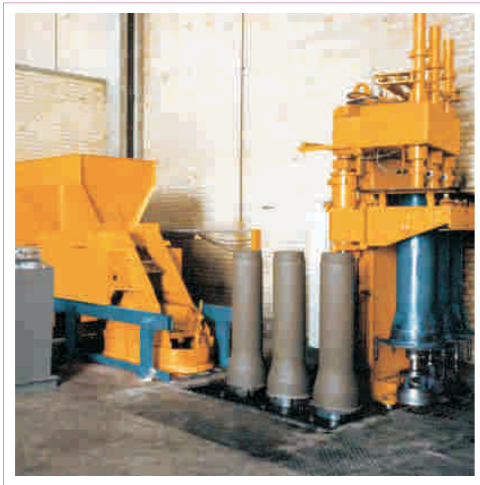
Fully automatic or semi-automatic production of small-bore quality concrete pipe from 100 to 600 mm (4"-24") in diameter