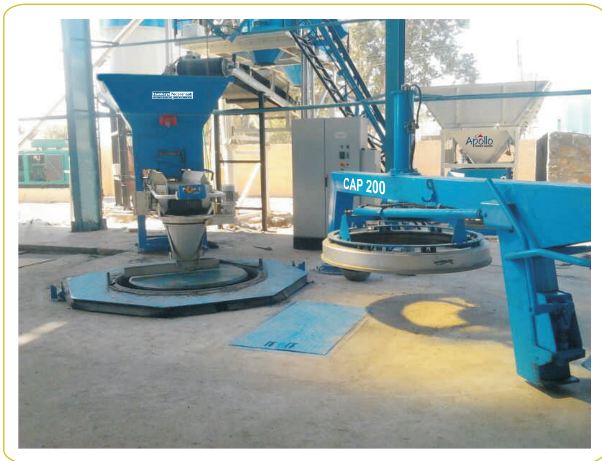
Versatile production of pipe, culverts and complete manhole systems of up to 2000 mm in diameter for circular units and up to 1200mm x 1200mm for square units

Concrete Pipe Making Machines CAP 150/200